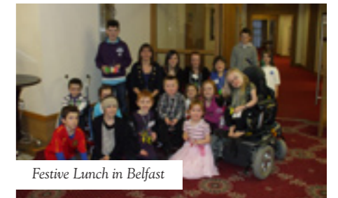
Festive Lunch in Belfast