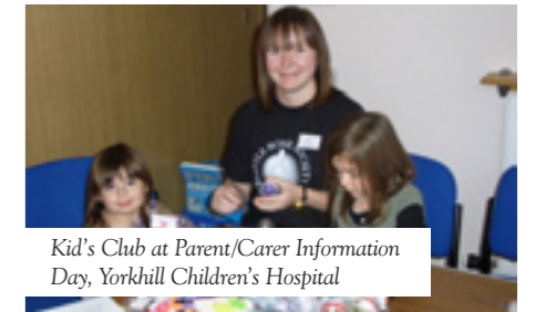
Kid's Club at Parent/Carer Information Day, Yorkhill Children's Hospital